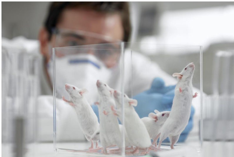
Mice were "humanised" with genes that allowed them to develop lungs and vascular systems similar to ours