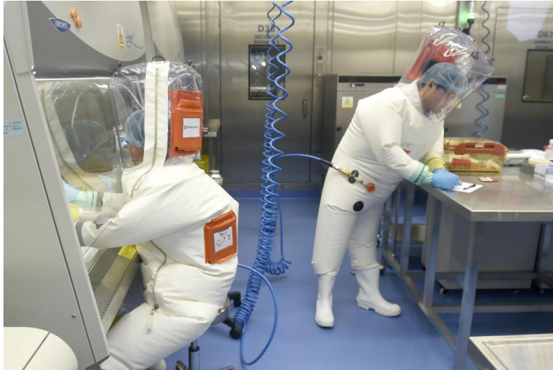
Before Covid-19 the Wuhan institute investigated whether mutant viruses they had created had the potential to spark a pandemic

The US embassy found out about the experiments in Wuhan and sent diplomats with scientific expertise to inspect the institute in January 2018, according to diplomatic cables leaked to The Washington Post. They observed “a serious shortage of appropriately trained technicians and investigators needed to safely operate this high-containment laboratory”.