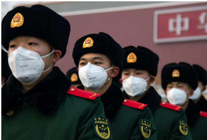
Chinese military staff were given positions of responsibility in the Wuhan institute long before Covid-19 emerged, according to a US Senate report

This explains why from the beginning of the outbreak, he says, the pandemic virus was so remarkably well adapted to infect humans.