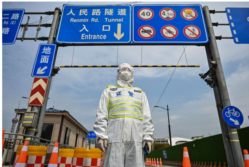
Many parts of China were still enduring lockdowns by late last year