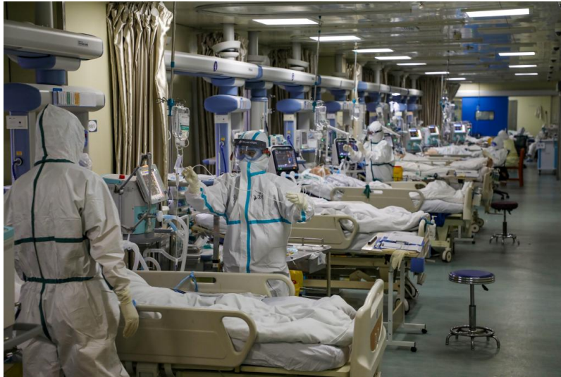
Chinese medical workers in protective suits in early February 2020