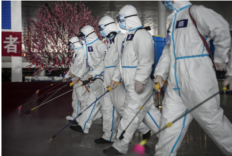
Firefighters disinfecting Wuhan airport in April 2020, after the coronavirus had gone global