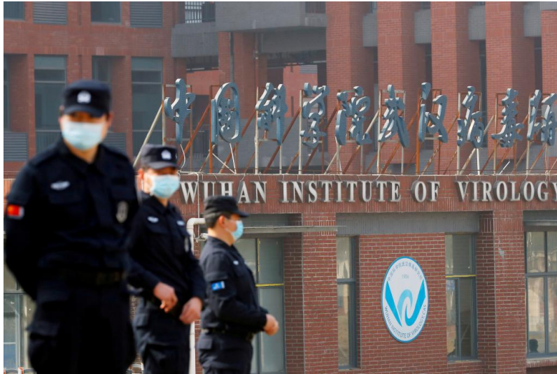
Covid-19 is widely believed to have originated at the Wuhan Institute of Virology

The institute was engaged in increasingly risky experiments on coronaviruses it gathered from bat caves in southern China. Initially, it made its findings public and argued the associated risks were justified because the work might help science develop vaccines.