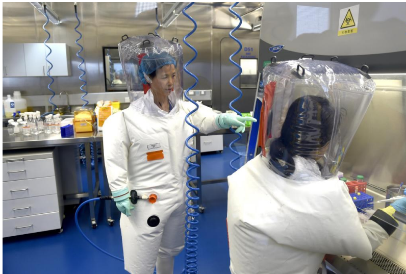
Shi Zhengli in 2017 with other researchers in a lab at the Wuhan Institute of Virology