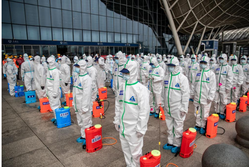
Railway workers disinfect the main station in Wuhan in March 2020

He reviewed some of the experiments and describes them as “by far the most reckless and dangerous research on coronaviruses — or indeed on any viruses — known to have been undertaken at any time in any location”.