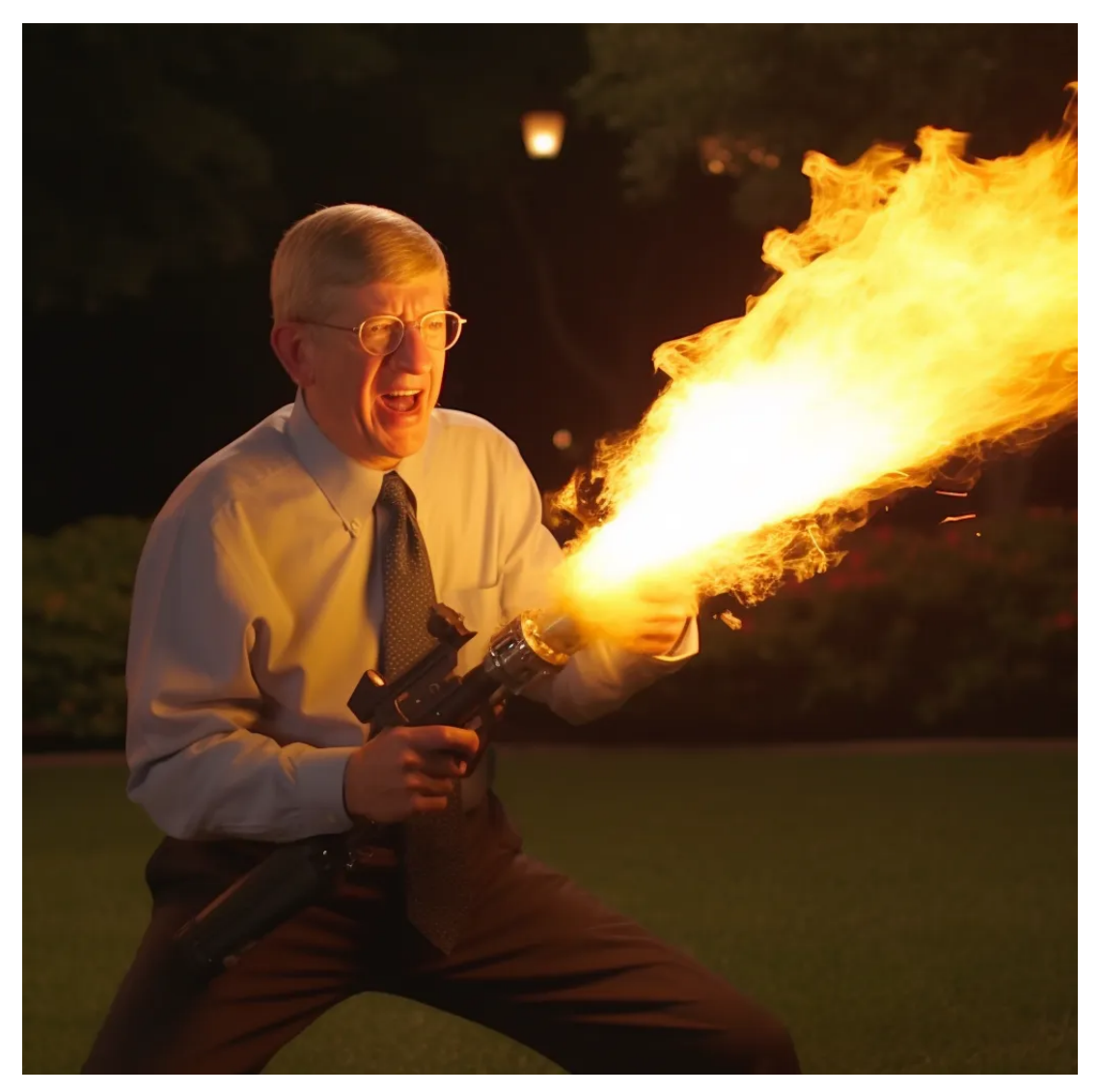
this'll fix those pesky insects!

his speech is neither apology nor contrition. it's an admission that he and others like him were so grossly unfit to hold any public power whatsoever as to amount to actual sociopathy.